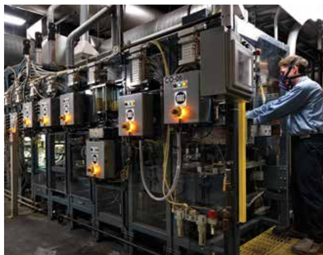
AGM INLINE CELL ASSEMBLY – Cells are loaded and move through a completely automated C.O.S. assembly process. The Inline C.O.S. Assembly process is a "Best-in-Class" manufacturing feature that delivers finished product integrity benefits that are unmatched in competitive terms.