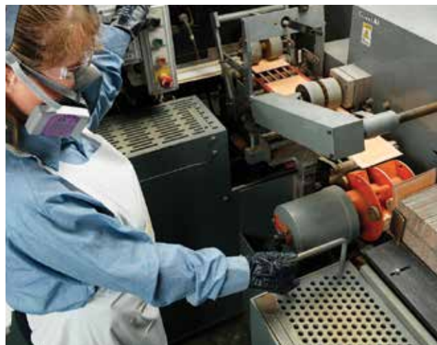
AGM PLATE WRAPPING & STACKING – Advanced AGM plate wrapper automatically delivers the highest levels of repeatable quality – ensuring product integrity and performance.

a manufacturing process designed around customer expectations for the end product...the CROWN1 Battery.