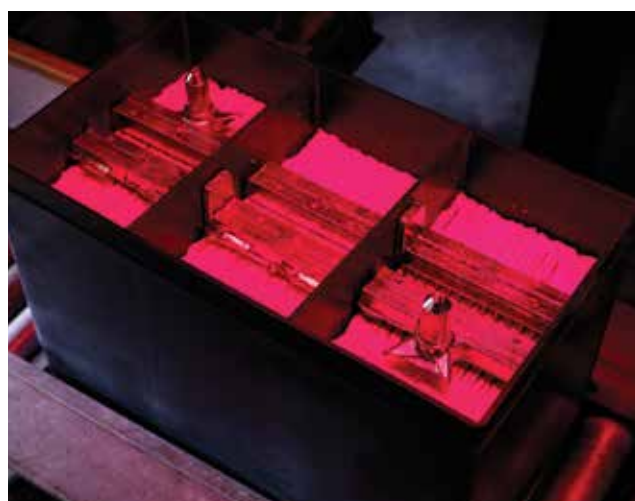
AGM VISION SYSTEM – This advanced process capability safeguards product integrity by verifying key battery components are correctly oriented and inserted into the container.